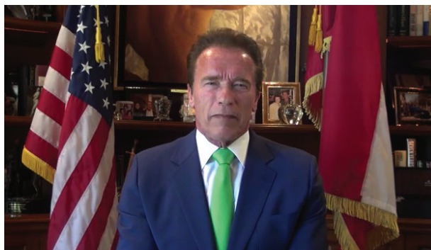
Arnold Schwarzenegger for the Summit of Conscience (July 21, 2015 - Paris)

Arnold Schwarzenegger, R20 Founder, who was unable to participate in person, sent in an inspiring video .